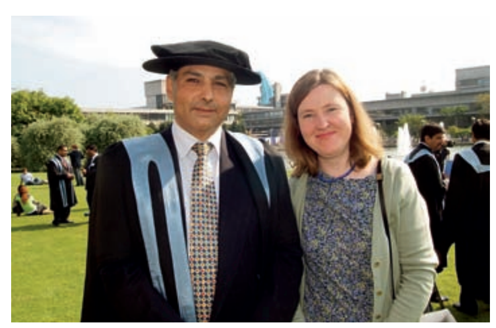
Conferees, May 2006