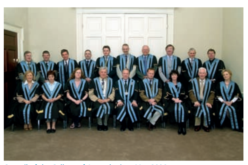
Council of the College of Anaesthetists, May 2006