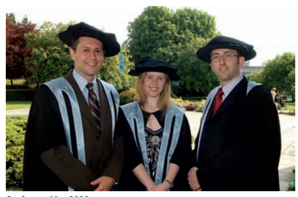
Conferees, May 2006