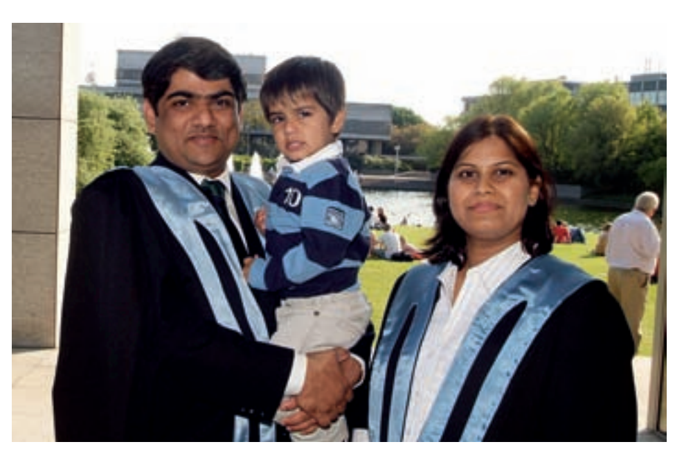
Conferees, May 2006