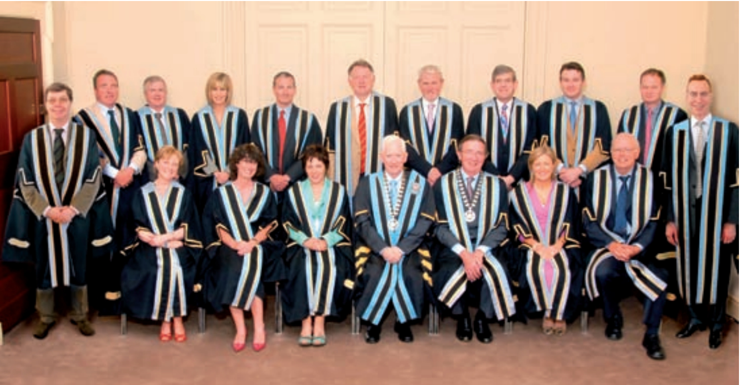
Council of The College of Anaesthetists of Ireland May 2008