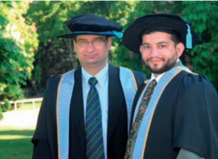
ICA May 2008