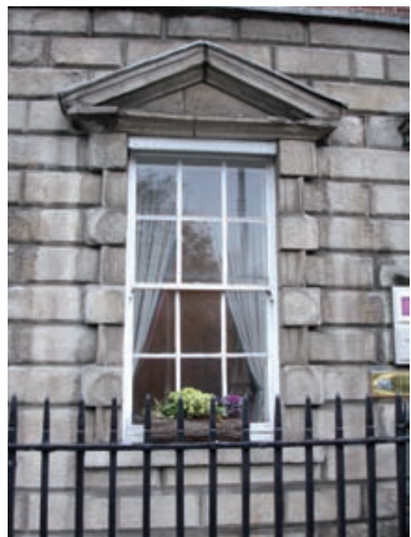
Window view at Merrion Square