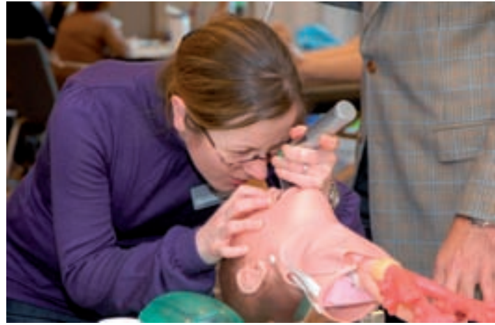
Airways Workshop October 2008