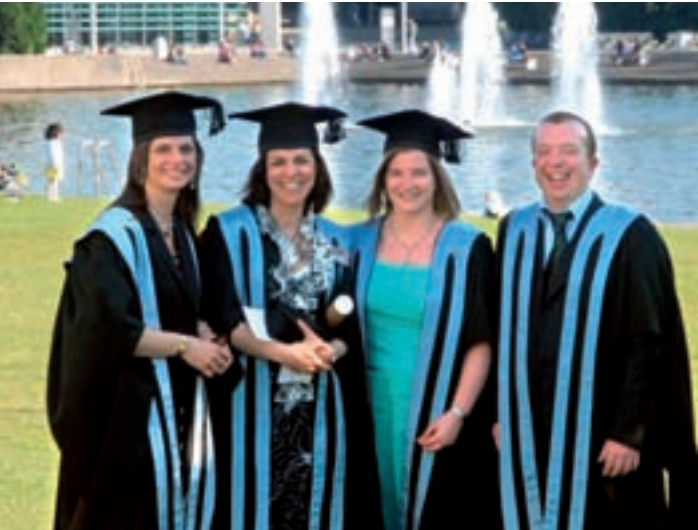
Conferees May 2008