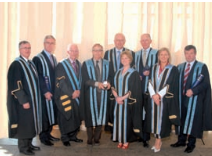
Honorary Fellows and Council Members May 2008