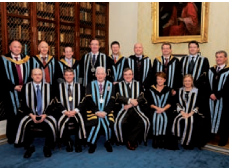
Pain Faculty Launch November 2008

Early in 2009 the faculty will be working towards recruiting ordinary fellows who have obtained the pain diploma exam, and will submit a dissertation for admission as a fellow. The faculty will also be working towards an alternative pathway to allow Pain Medicine Consultants in the UK, with Anaesthetic Fellowships from our College to gain admission to The Faculty.